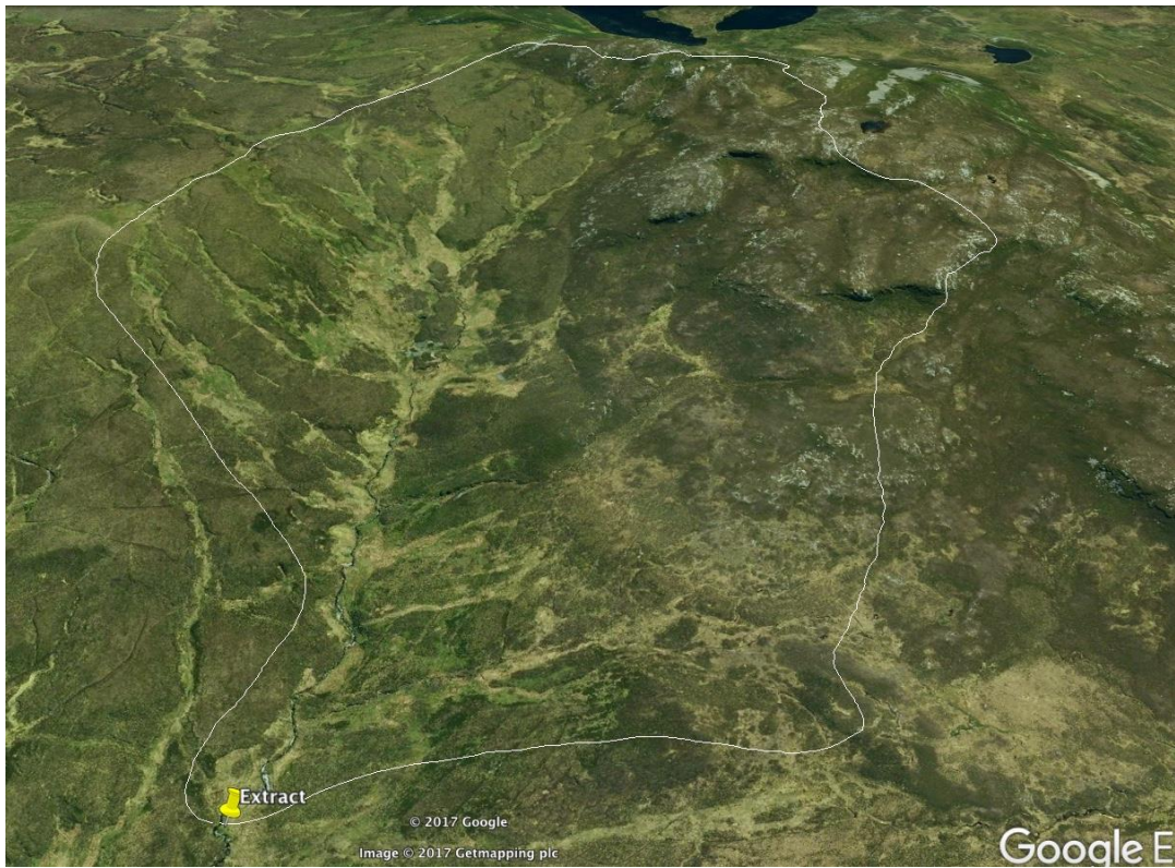
Catchment edge transferred to OS coordinates, as supplied to Wallingford HydroSolutions: