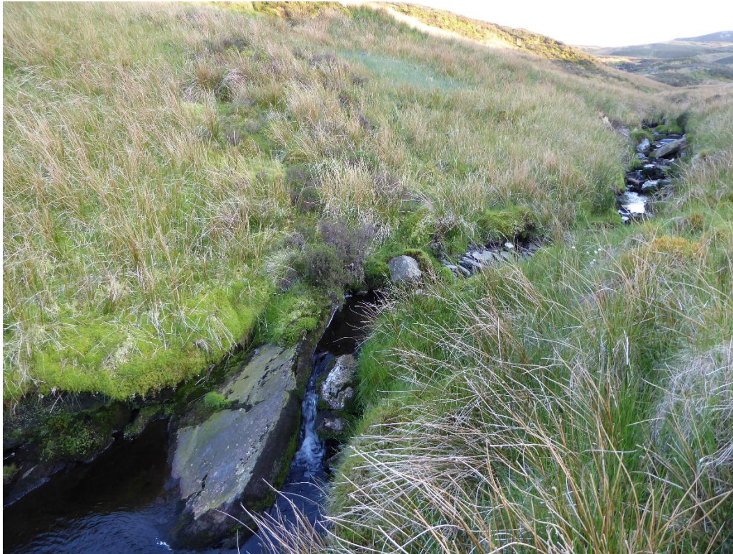
View downstream from "Tips":